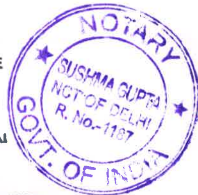
Photo Copy Attested SEP 2018